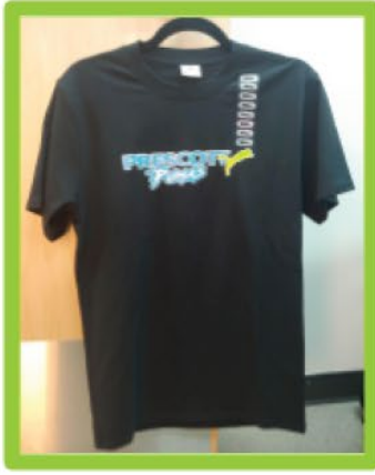
YOUTH T-SHIRTS (Black/Grey) $12 ADULT T-SHIRTS (Black/Grey) $15