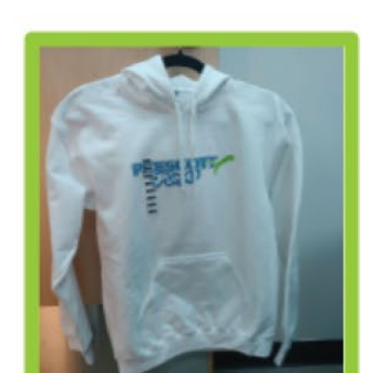
YOUTH HOODIE (Black/Grey/White) $30 ADULT HOODIE (Black/Grey/White) $32