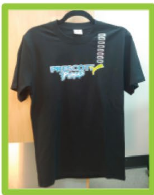
YOUTH T-SHIRTS (Black/Grey) $12 ADULT T-SHIRTS (Black/Grey) $15

Final Orders are Due April 30<sup>th</sup>. Puma Wear Order form or contact the office at prescott@psd.ca