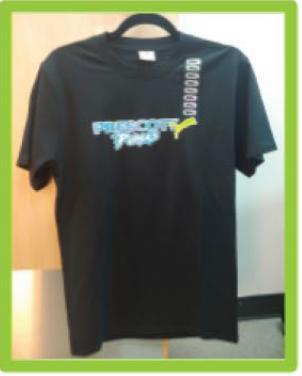
YOUTH T-SHIRTS (Black/Grey) $12 ADULT T-SHIRTS (Black/Grey) $15

Final Orders are Due April 30<sup>th</sup>. Puma Wear Order form or contact the office at prescott@psd.ca