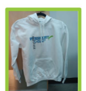
YOUTH HOODIE (Black/Grey/White) $30 ADULT HOODIE (Black/Grey/White) $32